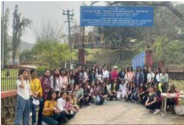
Visit to Madan Kamdev, an famous archeological site on 17 th March 2023