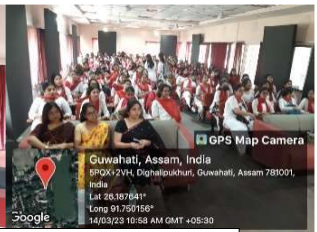
Career Counseling Workshop on Campus to Corporate held on 14 th March 2023