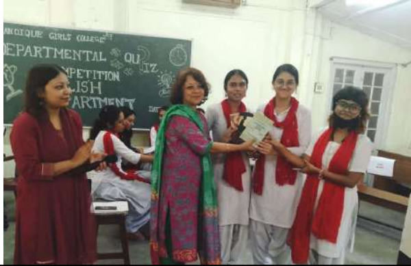
Awarding Prize to Winning Team of Quiz Competition