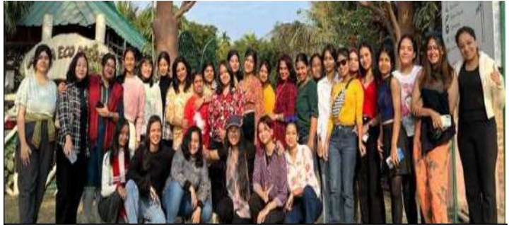
Field Trip to Pobitora National Sanctuary organized by Dept. of Political Science on 31 st Jan, 2023