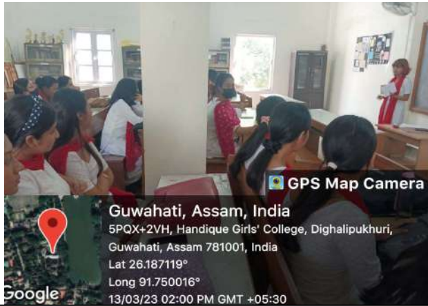
Students in Book Reading Session organized by Book Club