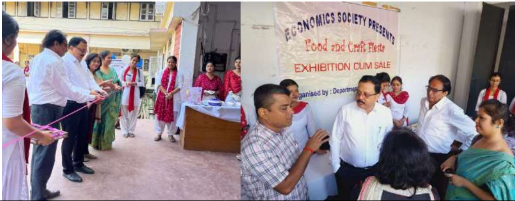
Exhibition cum Sale of Food and Craft Manufactured by Students: An Initiative to Promote Entrepreneurship