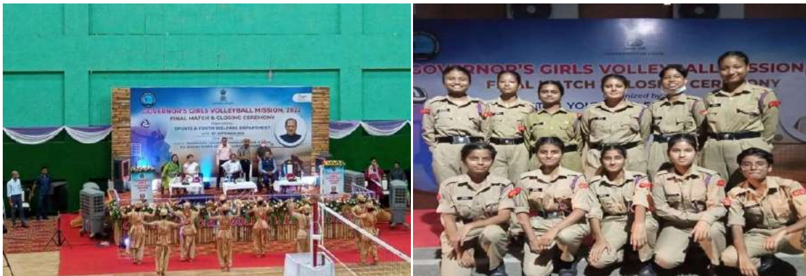
Cadets participating in the Final Competition and Closing Ceremony of Governor's Girls' Volleyball Mission organised by the Department of Sports and Youth Welfare, Assam on 21 st September 2022