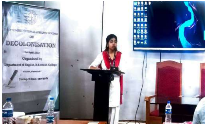
Paper Presentation by student of Handique Girls' College at B. Borooah College on 1 st April, 2023