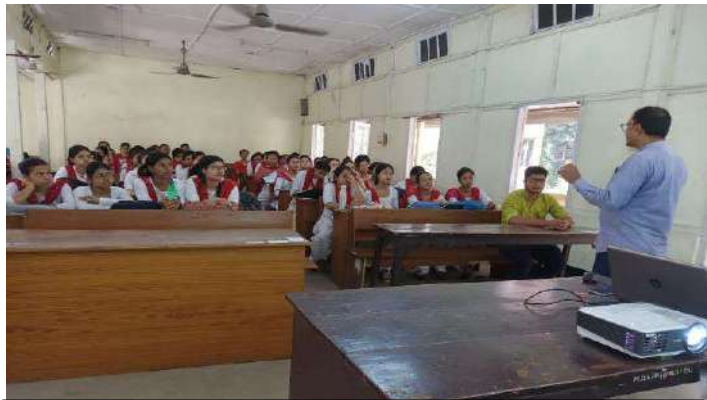
Orientation on the Use of E-Recourses by College Librarian