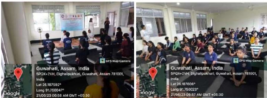
Observation of International Yoga Day, 2023