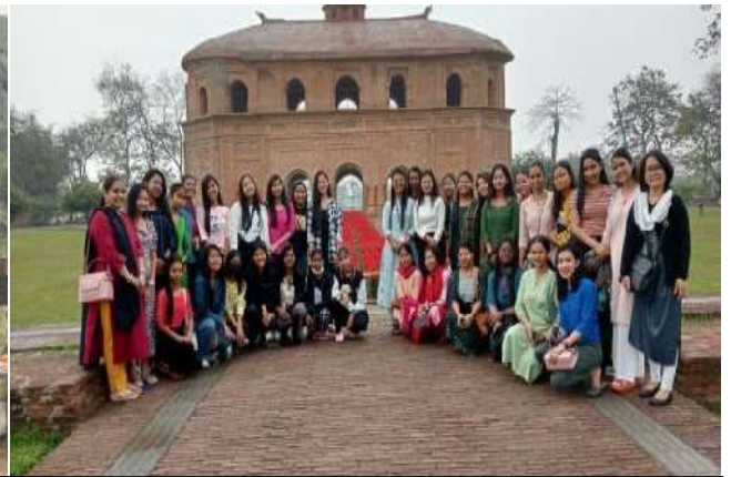
Visit to Sibsagar , a site of historical importance on 16 th March 2023