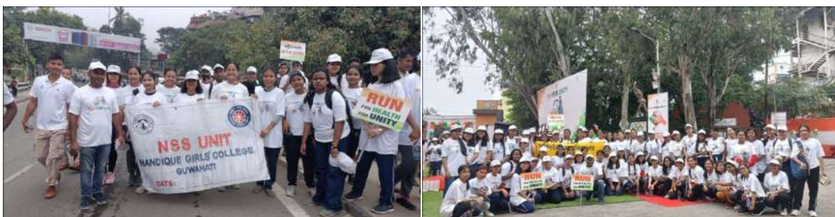
The NSS Unit participating in "Run for Unity" on the occasion of Rashtriya Ekta Divas organised the government of Assam from Nehru Stadium around Dighalipukhuri and back to Nehru Stadium on 31/10/2022