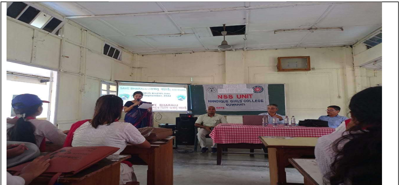
Save Bharalu Abhijan: World Rivers Day , Awareness programme organized by NSS unit in collaboration with Save Bharalu Abhijan

NB: Please provide three best high-resolution photographs of any activity/event/infrastructural facility of the college during the year 2022-23.