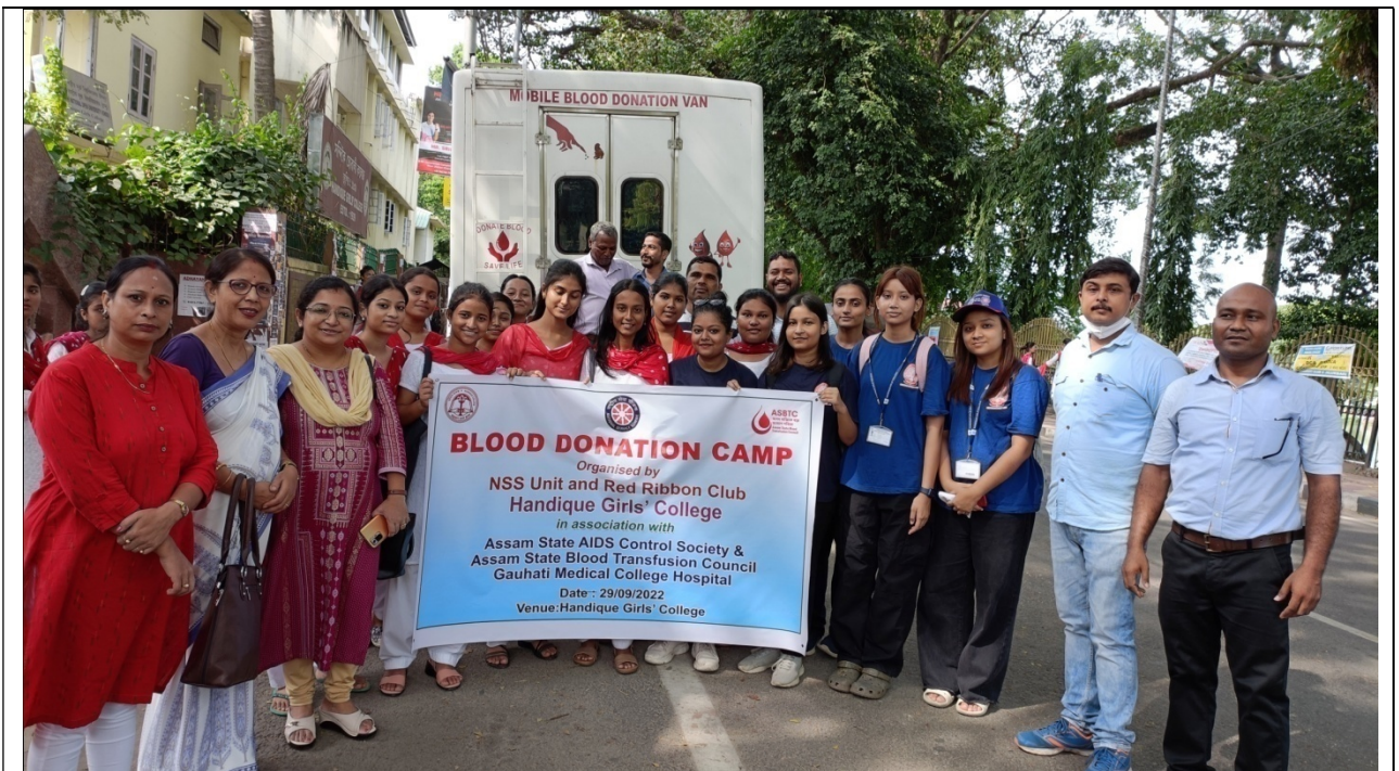
Blood donation camp organized by NSS unit and Red Ribbon Club in association with Assam State AIDS Control Society and Assam State Blood Transfusion Council and Gauhati Medical College Hospital